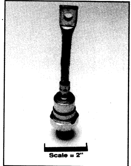
R602__22/R603__22 Fast Recovery Rectifier 220 Amperes Average, 1600 Volts