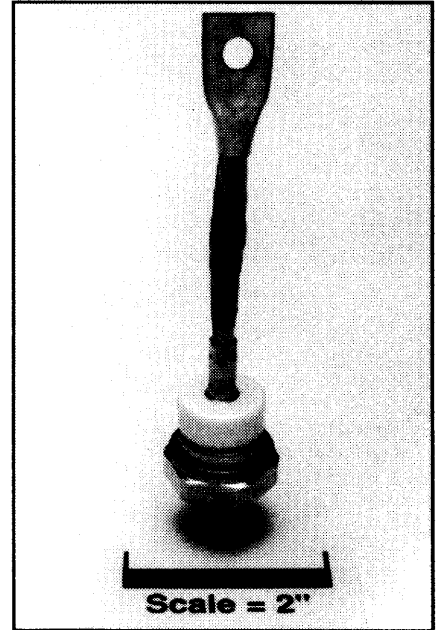
R502__10/R503__10 Fast Recovery Rectifier 100 Amperes Average, 1200 Volts