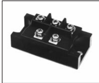
ME501210, ME501610 Three-Phase Diode Bridge Modules 100 Amperes/1200-1600 Volts