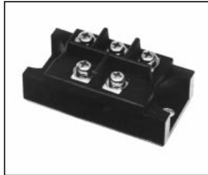
ME500810 Three-Phase Diode Bridge Modules 100 Amperes/800 Volts