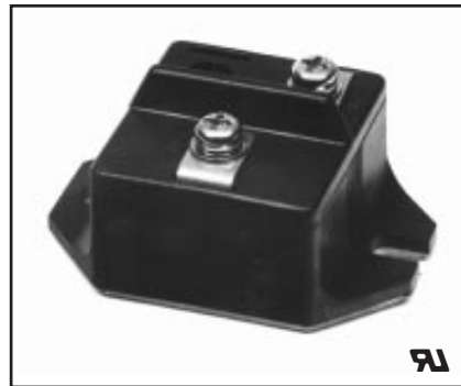
CS240650, CS241250 Fast Recovery Single Diode Modules 50 Amperes/600-1200 Volts