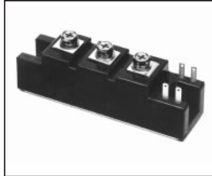
CM4312A2, CM4316A2 Dual SCR POW-R-BLOK™ Modules 25 Amperes/1200-1600 Volts