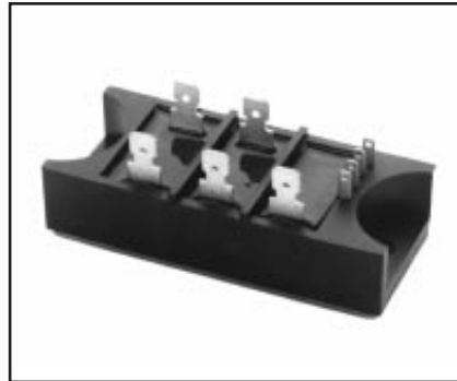
CE720802 Three-Phase SCR/Diode Bridge Modules 20 Amperes/800 Volts