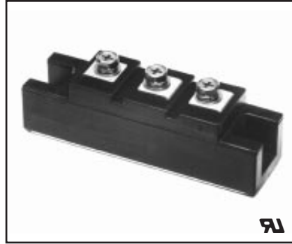
CDD11210, CDD11610 Dual Diode POW-R-BLOK™ Modules 100 Amperes/1200-1600 Volts