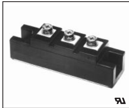
CD411230, CD411630 Dual Diode POW-R-BLOK™ Modules 30 Amperes/1200-1600 Volts