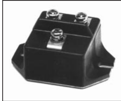
CD240602, CD241202 Fast Recovery Dual Diode Modules 20 Amperes/600-1200 Volts