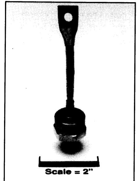
IN3288A, AR - IN3297A, AR (Outline Drawing)